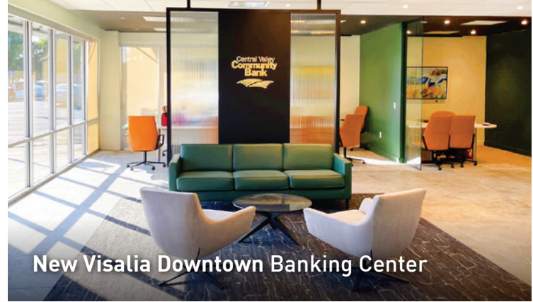
New Visalia Downtown Banking Center

The new Visalia Downtown Banking Center officially opened for business on November 6. The Banking Center is designed to elevate clients' "relationship banking" experience in a comfortable, private setting that's conveniently located among Downtown Visalia's thriving business, dining and shopping destinations. Clients will enjoy experiencing CVCB's full-service banking and exceptional service in a professional, contemporary environment enhanced by local artwork and other amenities, including a conference space available for their use.